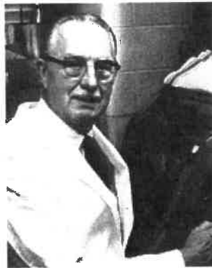
The day George Gey got his hands on Lacks's cells, everything changed.